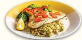
Seared Fresh Barramundi 香煎鮮盲曹魚 $118