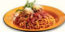
Spaghetti Meatballs 自家製肉丸蕃茄意粉 $108