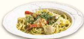
Seafood Pesto Linguine 青醬海鮮扁意粉 $188