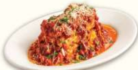
Homemade Lasagna 自家製焗肉醬千層麵 $148