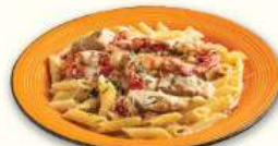
Penne Rustica 焗鮮蝦雞肉長通粉 $148