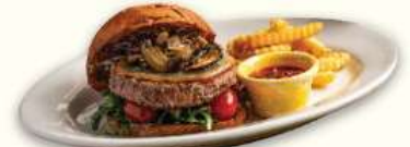
Italian Hamburger 意式野菌漢堡 $168