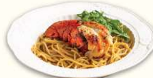
Grilled Lobster Tail Spaghetti 波士頓龍蝦尾意粉 $268