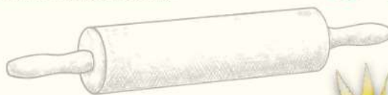
Cannoli Plate 西西里奶酪卷