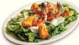
Shrimp Caesar Salad 燒蝦凱撒沙律 $128