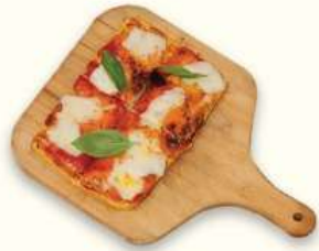
Chef's Pizza 主廚薄餅 $88

Served with Bread, Soup or Salad and Coffee, Tea or Soda 奉送麵包、沙律或餐湯及咖啡、茶或汽水