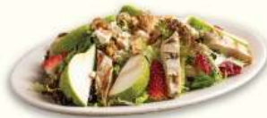
Mulberry Salad 野莓雞肉沙律 $108