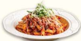
Ragù Bolognese Penne 自家製波隆納肉醬長通粉 $98