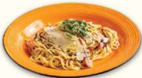
Spaghetti Carbonara 卡邦尼白汁煙肉意粉 $108