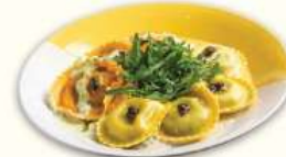
Ravioli Duo 意大利雲吞二重奏 $168