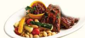
Pomegranate Balsamic Glazed & Grilled Baby Pork Ribs 嫩烤甜酸豬肋排 $128