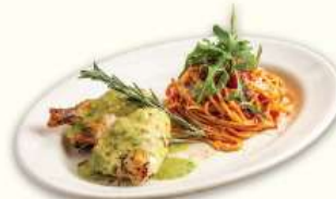
Rosemary Chicken with Spaghetti 迷迭香焗雞 $118