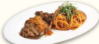
6oz Ribeye Steak Pizzaiola with Spaghetti 蘑菇燒汁肉眼扒 $198